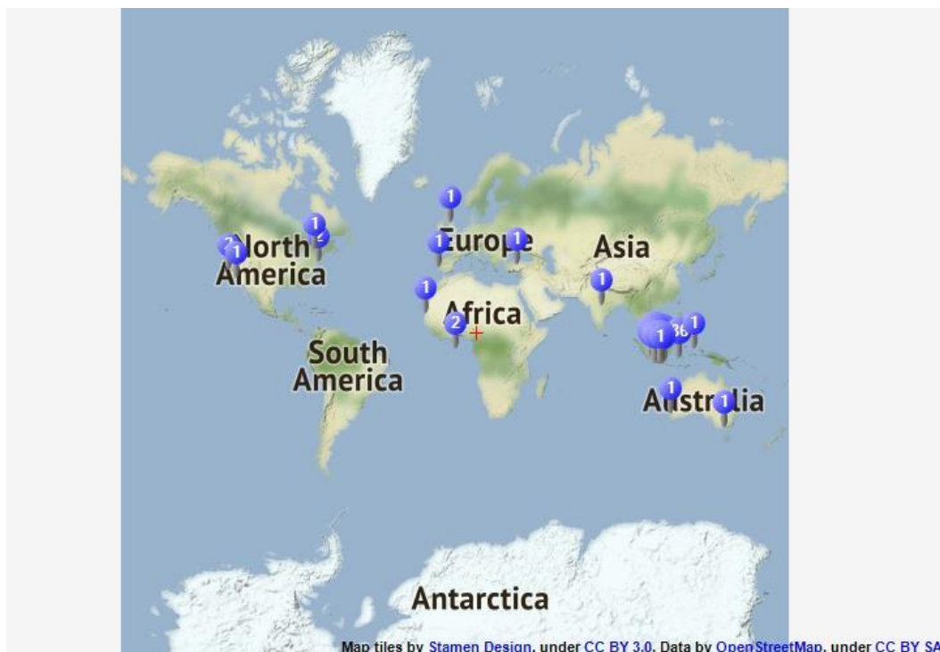
Map tiles by Stamen Design , under CC BY 3.0 . Data by OpenStreetMap , under CC BY SA Figure 5. Map Nvivo 12 Plus

Ganjar Pranowo not only concerns the citizens of Central Java, but also the attention of citizens of Indonesia and abroad. Its popularity is due to its image as a strict, disciplined and hamburger leader. Ganjar Pranowo's Twitter account has many followers, around 1.3 million. Based on the Map processed by Nvivo 12 Plus above, it shows that the accounts that interact with @ganjarpranowo are not only Central Javanese and Indonesian citizens but also are of concern to foreigners such as Asia, Australia, Africa, Europe, and North America.