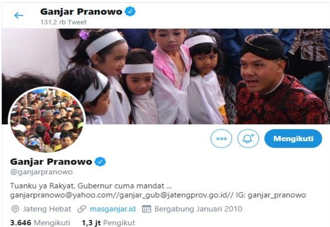
Figure 1. Twitter Account Ganjar Pranowo

Twitter is used by Ganjar Pranowo in establishing communication with the people of Central Java. As the head of the Central Java region, Ganjar Pranowo uses social media to convey his daily activities as the head of the area and also his activities, for example providing information on the latest work program, handling a problem, the form of cooperation carried out by the local government, opinion polls, advice, or just to greet the public. All of that was done as an effort to establish communication between leaders and the community. Ganjar Pranowo's Twitter account has around 1.3 million followers, following 3,646 accounts and 131.2 thousand tweets. The Twitter account name used by Ganjar Pranowo is @ganjarpranowo. Here is a Ganjar Pranowo Twitter account.